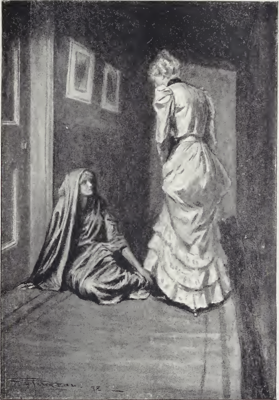
SHE STOOD SILENT, STRICKEN WITH ASTONISHMENT